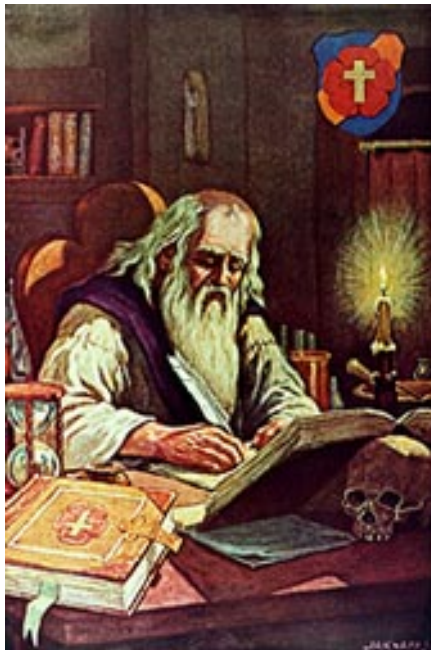
Frater C.R.C. - Christian Rose Cross (symbolical representation)