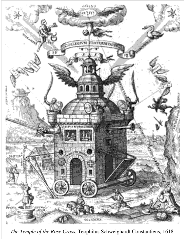
The Temple of the Rose Cross , Teophilus Schweighardt Constantiens, 1618.

During Rosenkreuz's lifetime, the Order was said to consist of no more than eight members, each a doctor and a sworn bachelor. Each member undertook an oath to heal the sick without payment, to maintain a secret fellowship, and to find a replacement for himself before he died. Three such generations had supposedly passed between c.1500 and c.1600, a time when scientific, philosophical and religious freedom had grown so that the public might benefit from the Rosicrucians' knowledge, so that they were now seeking good men. [6]