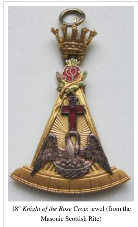
18° Knight of the Rose Croix jewel (from the Masonic Scottish Rite)

After 1782, this highly secretive society added Egyptian, Greek and Druidic mysteries to its alchemy system. [19] A comparative study of what is known about the Gold and Rosenkreuzer appears to reveal, on the one hand, that it has influenced the creation of some modern Initiatic groups and, on the other hand, that the Nazis (see The Occult Roots