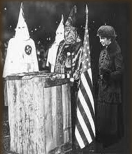
Margaret Sanger gets ready to speak at the KKK Rally at Silverloke.

More truth about Margaret Sanger , the evil who started it all, and the Black Genocide plan: http://www.dianedew.com/black.htm