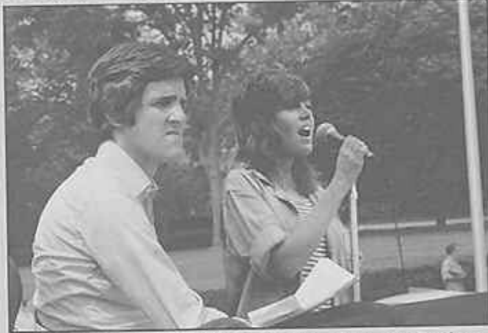
Actress And Anti-War Activist Jane Fonda Speaks to a crowd of Vietnam Veterans as Activist and former Vietnam Vet John Kerry (LEFT) listens and prepares to speak next concerning the war in Vietnam